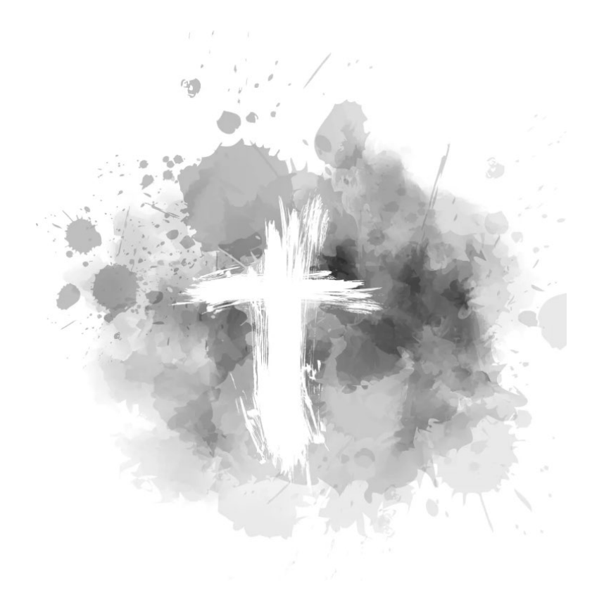
The Second Week in Lent 2025