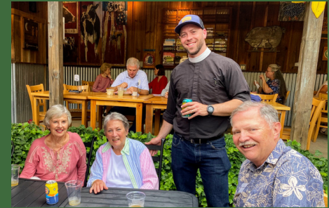
Feast of St. John 2022