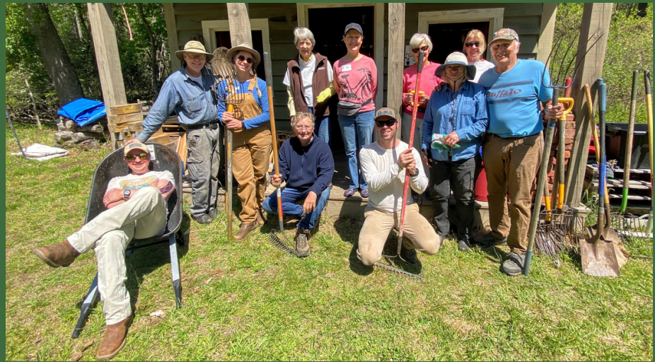
In April, Gardeners mulched walkways, filled raised beds with soil and compost, cleaned garden signs, and sowed wildflower seeds.

We invite you to join us at our next “Good News Gardeners” workday on Tuesday, June 27, from 9:00 to 11:00am at the Foster Education Garden at Kanuga. Please note the earlier time due to the warming temperatures. We will be weeding and harvesting. Supplies and tools will be provided, but you are welcome to bring your favorite gloves or tools. Please bring a water bottle. Afterward, we will stay for lunch in the conference center.