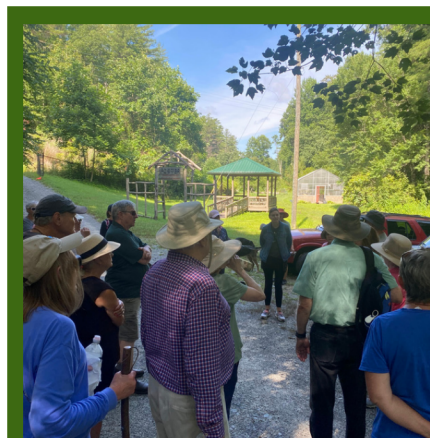
Holy Hikers saw and learned about the Educational Garden on their trip to Kanuga in July.