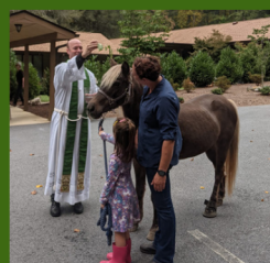
Each animal is blessed by name and either sprinkled with Holy Water or has hands laid upon it to impart God's power into the creature.