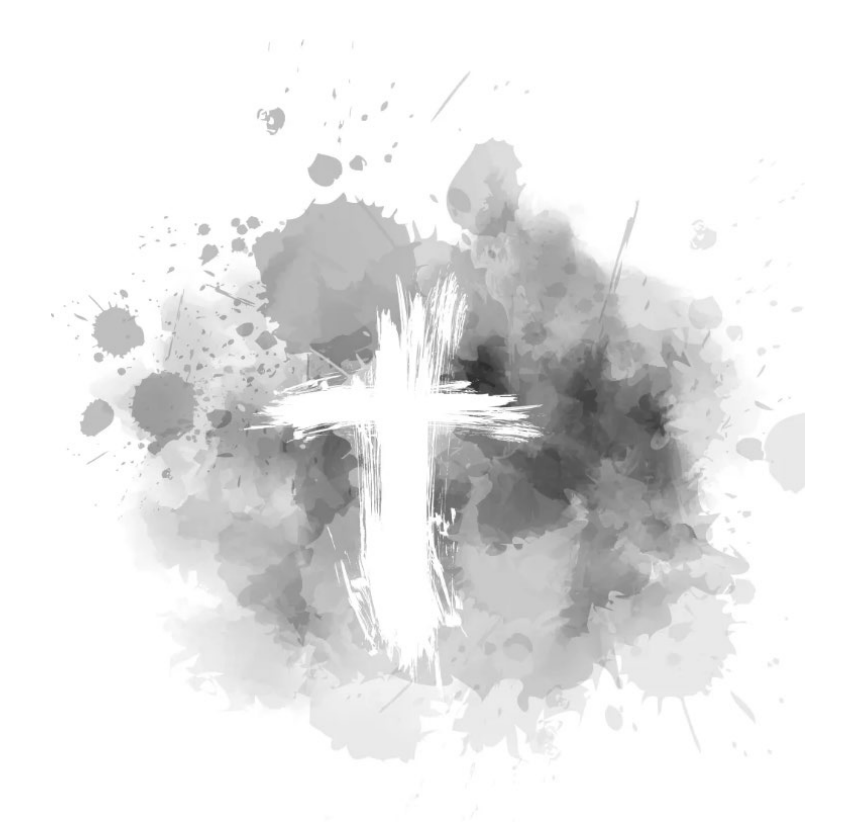
The Third Week in Lent 2025